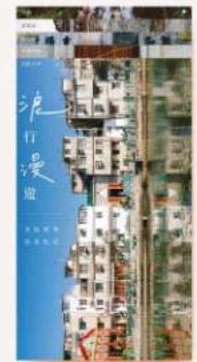
Walks in the Northern District