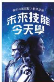
6 Future Skills You Should Learn Now