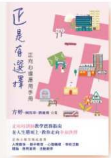
Making Positive Choices