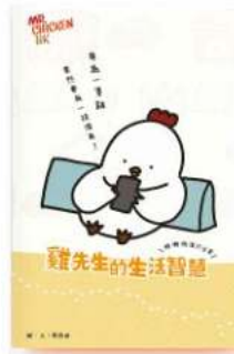
Mr Chicken's Philosophy

In collaboration with professional workers, experts from different sectors, as well as creative young writers, the Federation published ten books for professional and leisure reading this year.