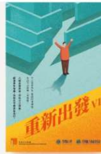
Turning Point VI