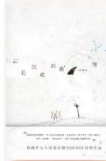
Curve in My Memories