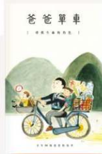
Dad's Bike: Roles in Life