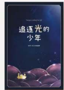
Teenagers Seeking the Light